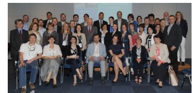
Second CAESAR network meeting at ECCMID, Barcelona 2014