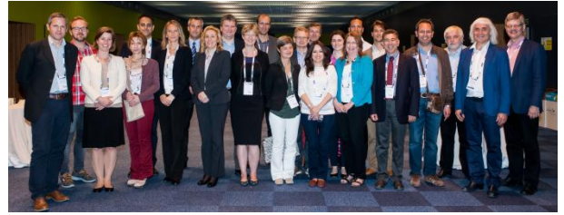
ESCMID Study Group for Antimicrobial Resistance Surveillance – ESGARS, ECCMID, Barcelona 2014