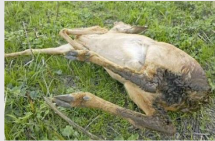
Figure 1: Dead roe deer. The underlying cause has so far been connected to symptoms of diarrhea and malnutrition of unknown etiology.

The Roe deer ( Capreolus capreolus ) population on the island of Funen, Denmark has since the year 2002, been suffering from increased mortality (fig. 1) and there has been a 50% reduction in the annual hunting bag (1, 2).