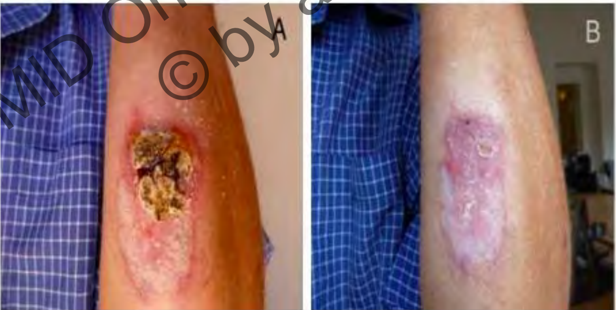
Fig. 2. Lesion before (A) and after second l-AmB treatment (B)