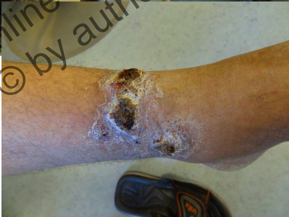
Volunteer aid-worker Syrian refugee camps Southern Turkey