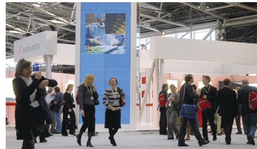
Exhibition at the 17th ECCMID / 25th ICC in Munich