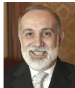
Prof Dr Giuseppe Cornaglia, 2007–present

The change of title of the Society to include infectious diseases was announced in 1989 while the journal, EJCMID, included it since the beginning of 1988). Except for the first line, the Statutes actually remained unchanged, amusingly maintaining the abbreviated title as ESCM for the European Society of Clinical Microbiology and Infectious Diseases. Only in 1991 in EJCMID, 10, p.470 did revised Statutes appear. There were then running revisions until the very end of 1994 when the EJC-MID ceased to be the official publication of the Society. A suggestion widely misunderstood in the EC was that cooption was necessary when elections produced a lack of representation of certain geographical areas or a lack of particular talents. However, it was finally included in the Statutes in 1993. Further updates were announced in ESCMID News in 1997 and 2002. It was realized that the German authorities, who had to approve the Statutes, had not been invited to do so for some years, and this required rather careful handling. Not all the details of the Society's modus operandi need to be in the Statutes, but they do need to be formally approved by the EC and be known to the members. This is the role of the Bylaws . These appear to