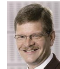
Pentti Huovinen, 2008