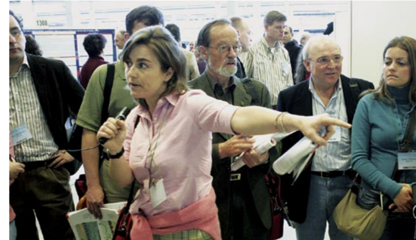
Poster walk at the 14th ECCMID 2004 in Prague. Poster walks were first introduced at the ECCMID Glasgow 2003.