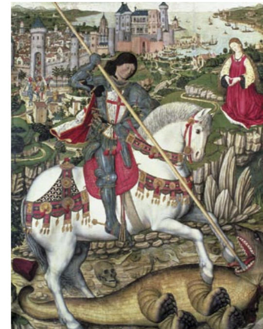
The 25-year anniversary of ESCMID will be commemorated at the 1st European Day of Fighting Infection in Barcelona, Spain on 23 April 2008.