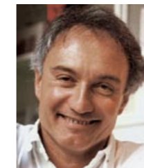
Patrice Courvalin, 2001