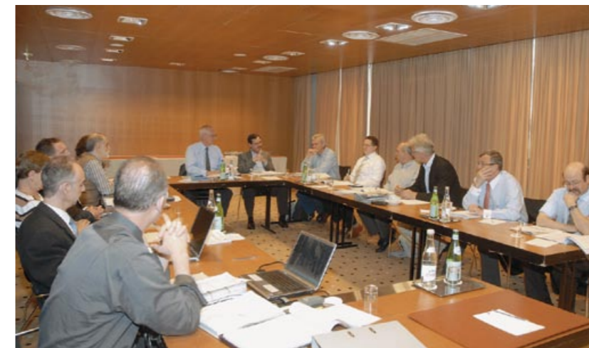
The Executive Committee at work, ECCMID 2006 in Nice