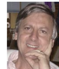
Didier Raoult, 2002