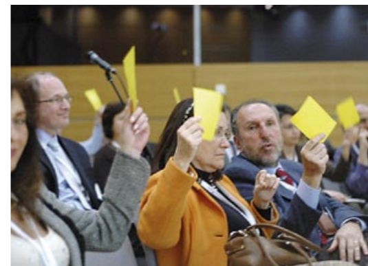
Members vote to approve changes to the Statutes at the Assembly of Members in 2007