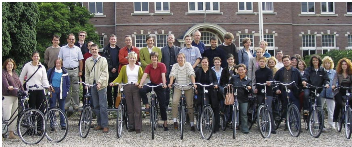
The second ESCMID School held in Utrecht, the Netherlands reflecting the local character of the setting

The idea for postgraduate course attendance grants was discussed by the first EC, and for all of the educational activities outlined above, ESCMID has provided direct financial support to young participants who are still in training, with precedence given to those who are members of the Society.