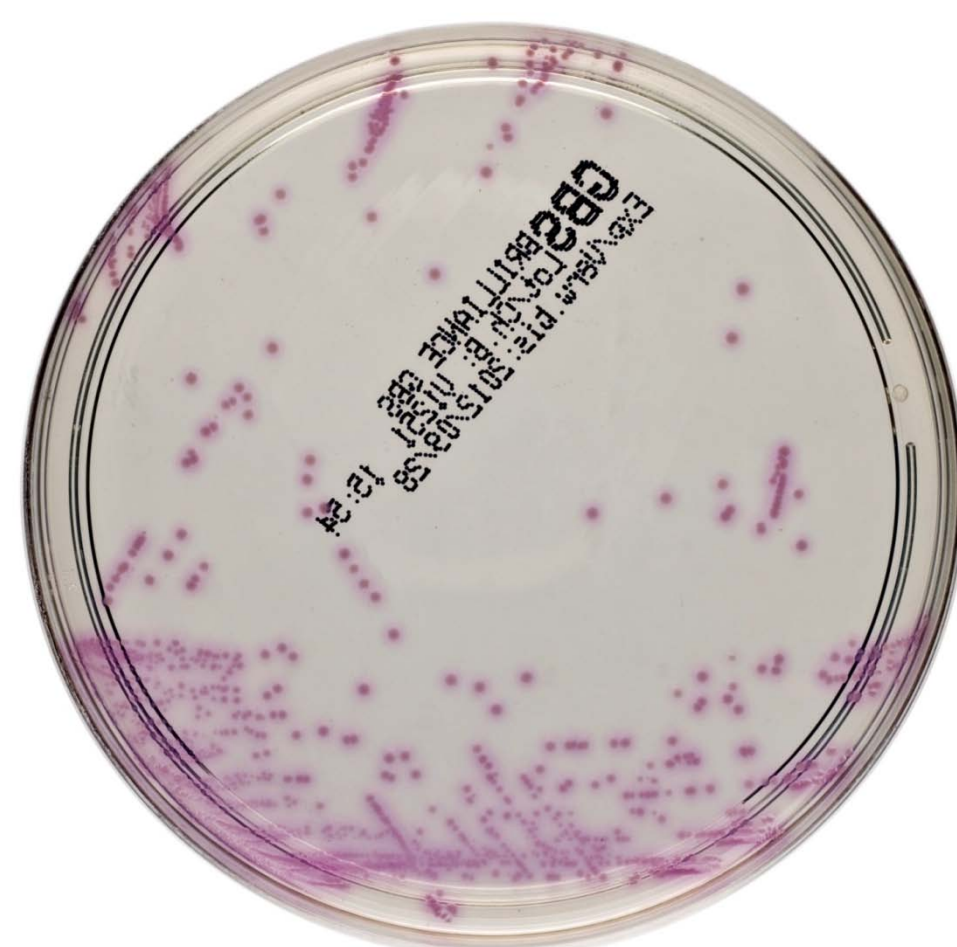
FIGURE 1. Typical growth of positive, pink GBS colonies on Brilliance GBS Agar after 24 hrs incubation.