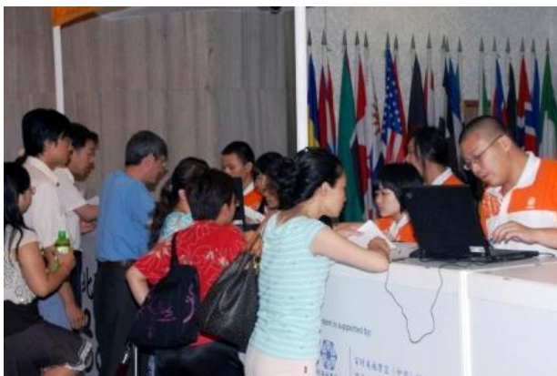
Registration desk on first day

As a publication that serves the needs of two million clinicians, the China Medical Tribune would be very interested in publishing selections from ESCMID's clinical guidelines, as well as highlights from our meetings and all other relevant information, thus helping to promote ESCMID and other ESCMID's initiatives to doctors within China and expanding the ESCMID visibility at large within the Chinese medical community.