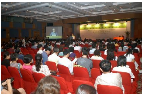
Delegates at plenary lecture